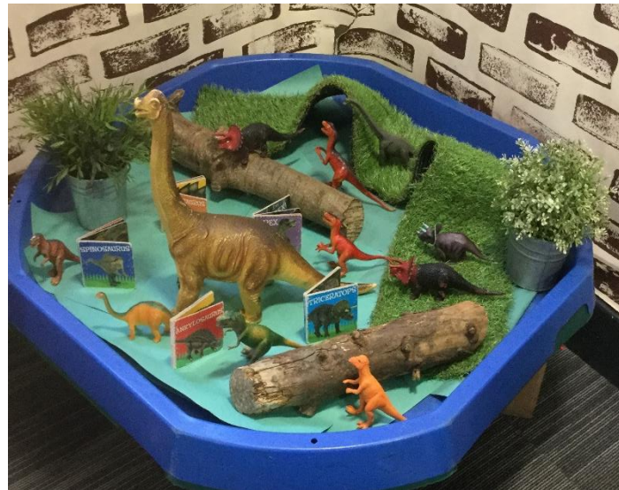
Playing with dinosaurs