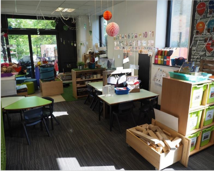
Inside our classroom

There are lots of things to do and play with in our classroom