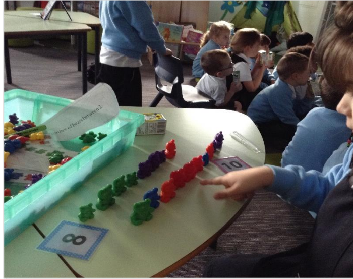
Some number work