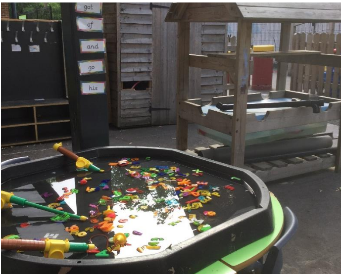
Our outside space